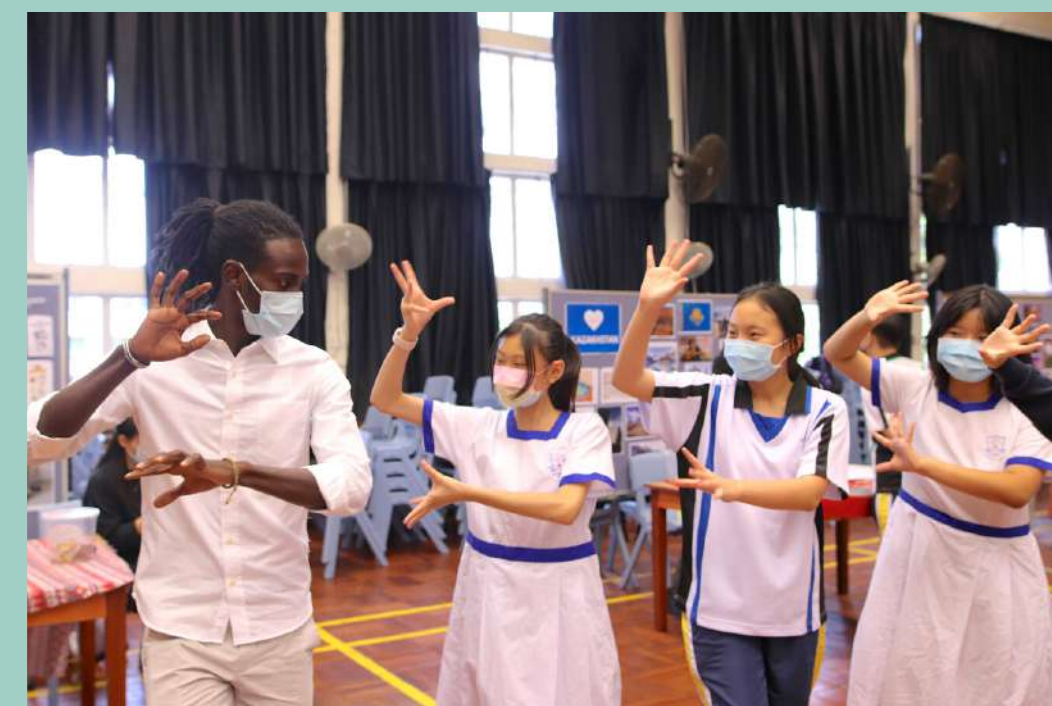
Interactive activities with local HK students