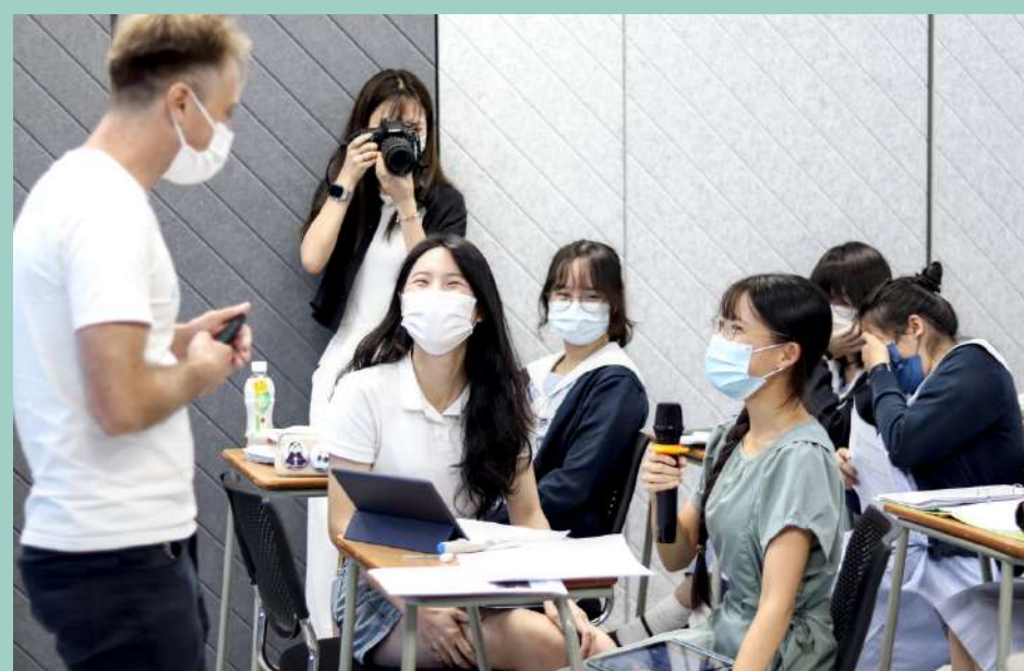
Saki (CUHK) from Japan comparing Japan and Chinese poems