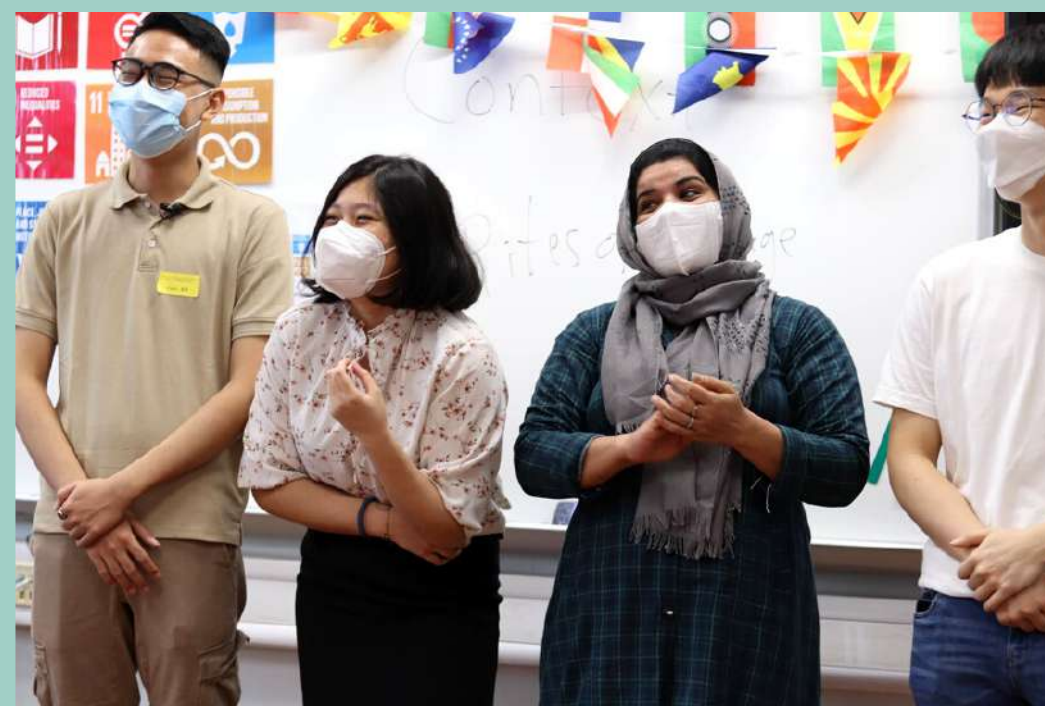
Sharing the uniqueness of different cultures