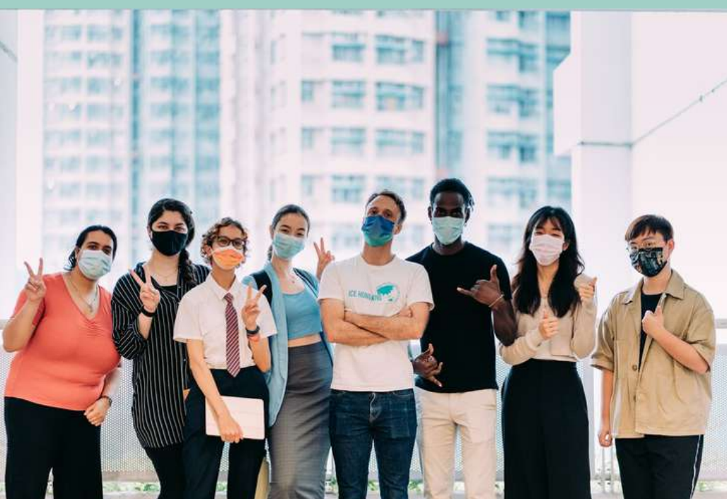
Meeting individuals from different backgrounds

Inter Cultural Education (ICE) is a social enterprise commits to connect people to understand the world and nurture global minds for a better tomorrow by providing a safe platform for cross-cultural dialogue and global learning. Since 2010, we have impacted 50,000+ students and worked with people from 100+ countries.